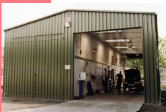
Double bay MOT testing station