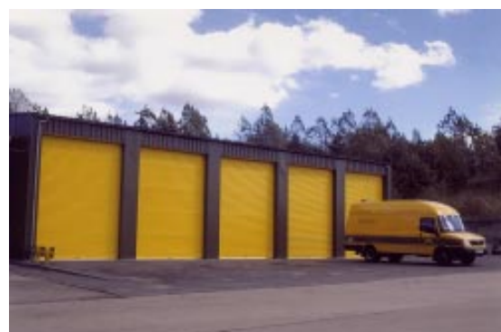
Local authority garage