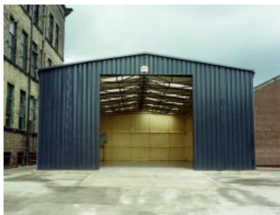
General purpose storage unit