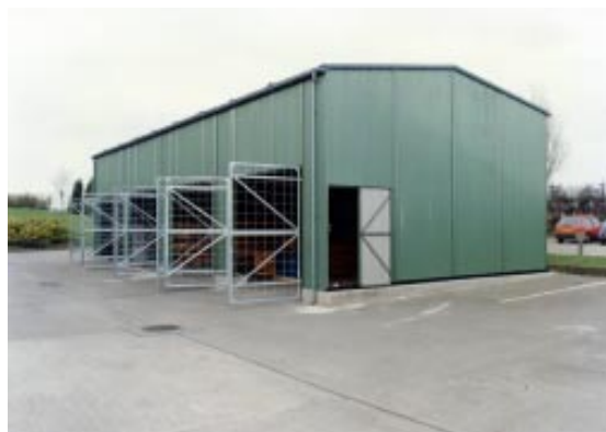
Timber storage unit