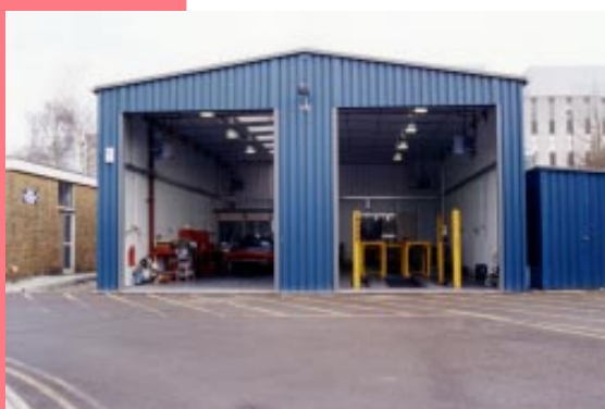
Chasis development building at The University of Hertfordshire.

A range of substantial buildings designed and manufactured to meet local planning requirements. Supplied with full technical specifications, foundation plans and design drawings.