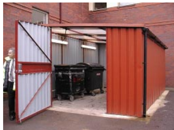
Building detailed 3.66m width x 5.59m length x 2.2m to 2.59m height, single 1.50m door. Terracotta plastisol cladding. Rain water goods & roof light panels