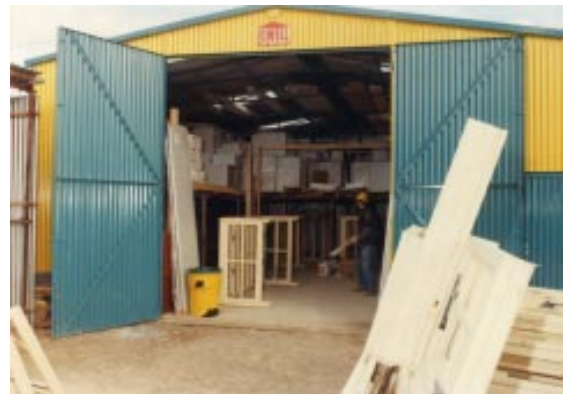
Construction Site Temporary Store