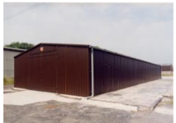
Commercial Vehicle Store